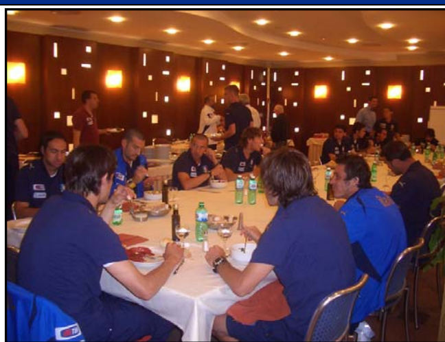
The Technical Centre of Coverciano has a limited number of places for participants on full board in double rooms (100 beds overall).

BY PLANE: from Amerigo Vespucci Airport the Technical Centre can be reached by taxi (30 mins) or by taking Line 23 bus, then changing to Line 10 or 17.